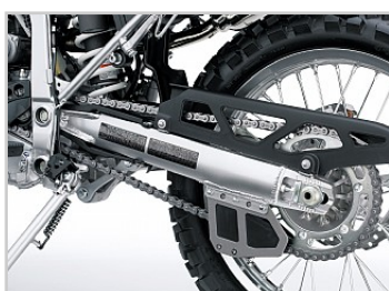
Frame and swingarm