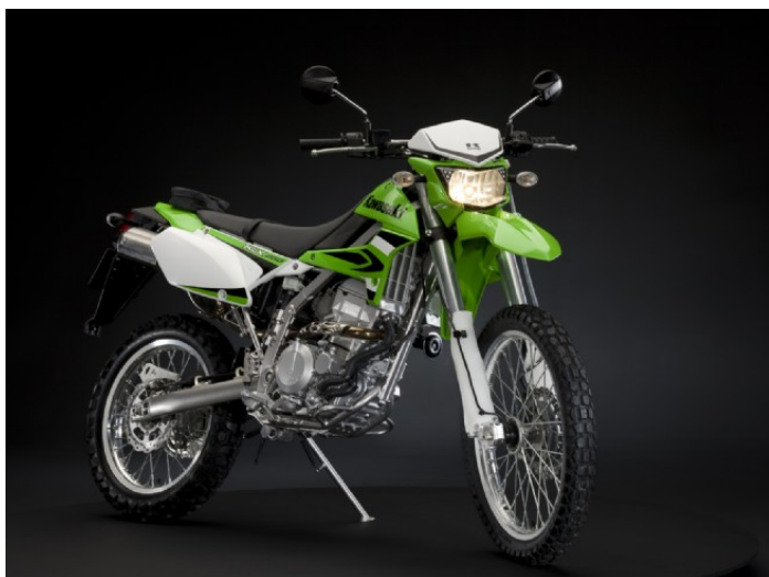
Model Year 2009