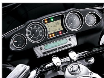
Multi-function instrumentation and audio