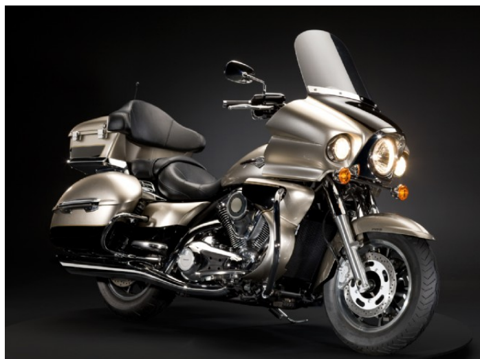
Model Year 2009